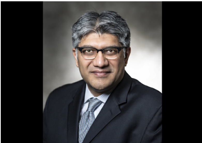
Biden energy official Jigar Shah